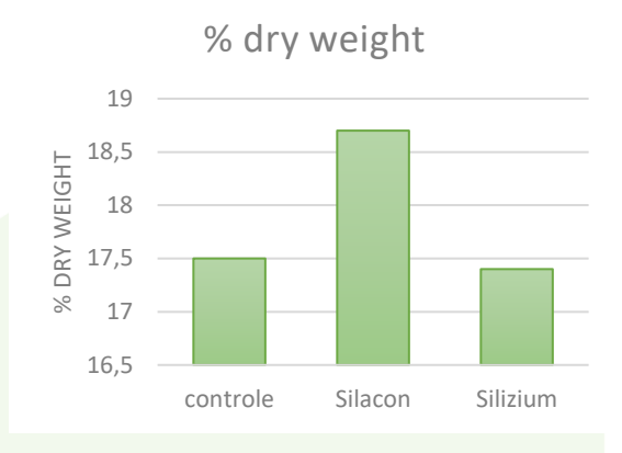
Figure 1: The dry weight increases more than 6% by using Silacon.

Treatment with Silacon resulted in a higher dry weight percentage of the fruit compared with the control object and the other silicon fertilizer. However, this year no effect on the firmness and storability of the fruits could be measured (Figure 1). The extremely hot and dry summer had a big impact on shelf life of all fruits. Possible more effects can be measured under normal conditions.